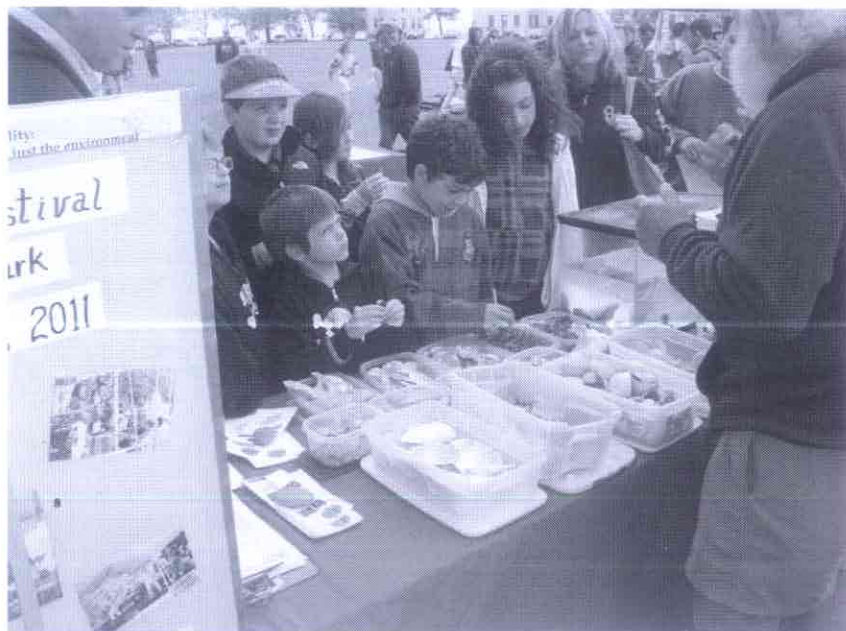
Youngsters at "Ocean Fun Day" learn about marine life – and pollution – in Raritan Bay.

New Jersey Friend's of Clearwater (NJFC) Traveling Environmental Festival (TEF) is our key educational tool for children of all ages, first presented in 1994.