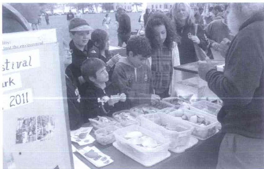
Youngsters at "Ocean Fun Day" learn about marine life – and pollution – in Raritan Bay.