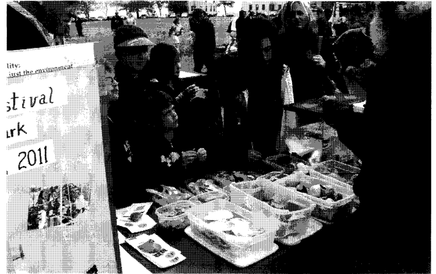
Youngsters at "Ocean Fun Day" learn about marine life – and pollution – in Raritan Bay.